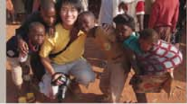
photos: Rwanda Mission Trip